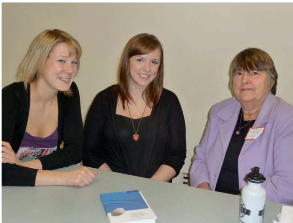
Human Book "Abnormally Normal" (far right) being borrowed by two student readers.

"I highly recommend this experience to other students." Reader respondent